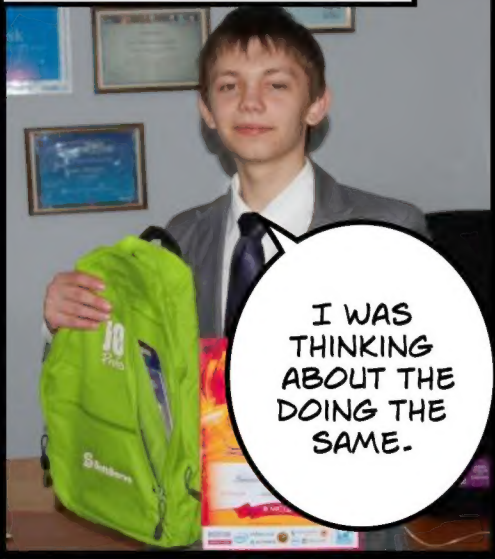
MEANWHILE AT REVIL'S HQ---

I WAS THINKING ABOUT THE DOING THE SAME.